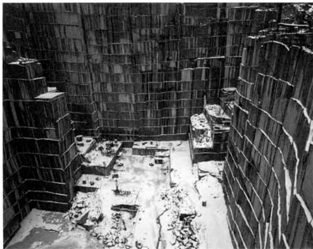
Edward Burtynsky, Rock of Ages #15, Active Granite Section, E. L. Smith Quarry, Barre, Vermont, 1992 , color photograph, 40 x 50".